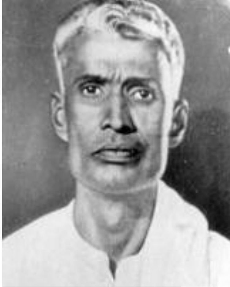
Udumalai Narayana Kavi (1899-1981)