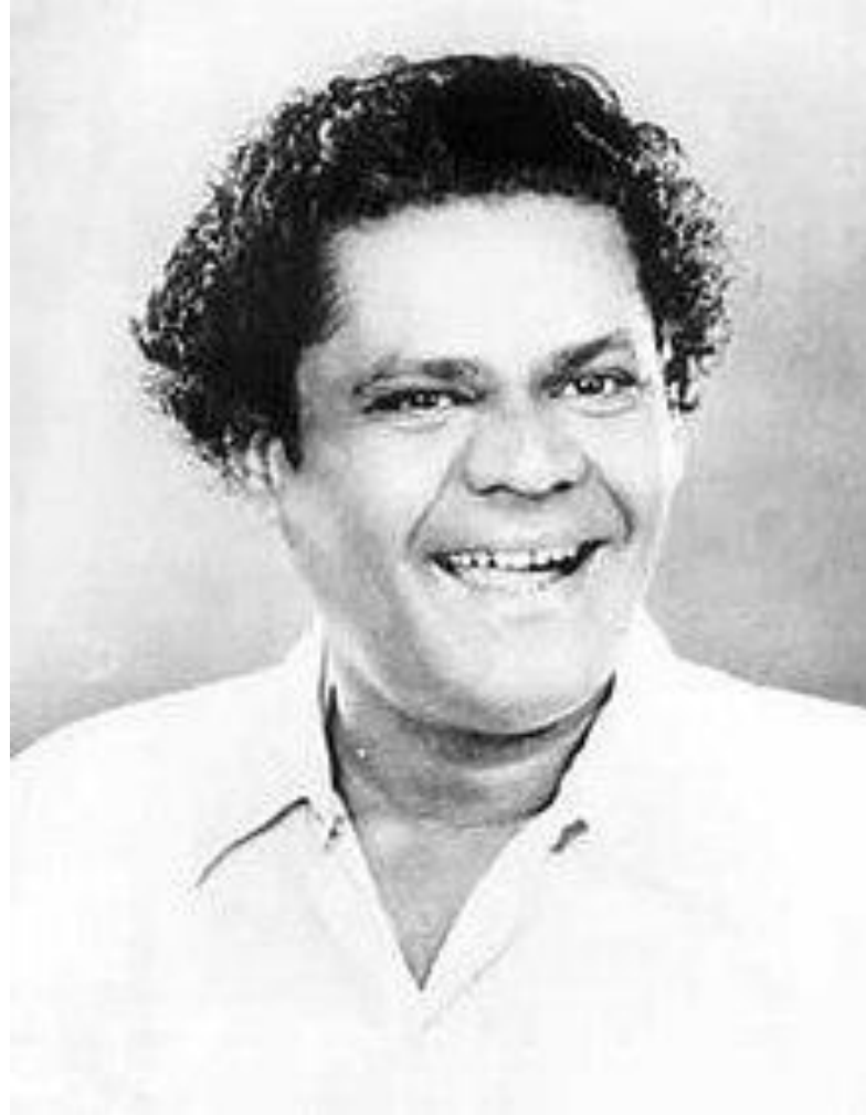
Kalaivanar N. S. Krishnan (1908-1957)